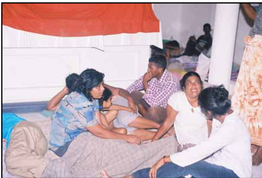
Displaced people need to be treated with dignity and honour