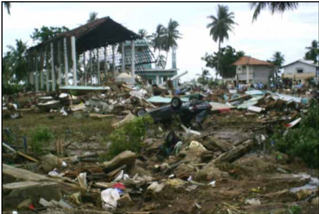
The mayhem

The team of the Disaster Management & Information Programme is strictly following these ethical principles and make decisions and implement them as a collective group.