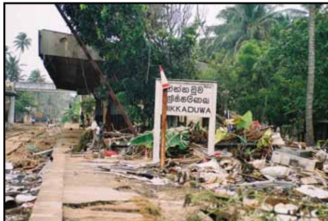
Garbage is a serious issue